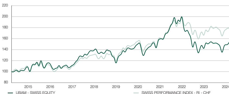
Performance over 10 years or since inception. Source of data: UBP. Exchange rate fluctuations can have a positive or a negative impact on performance. Past performance is not a reliable indicator of future results. The value of investments can fall as well as rise.